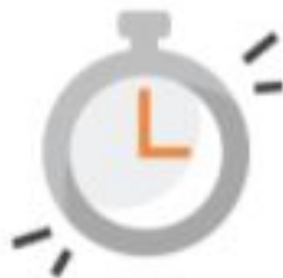
Ability to Work Under Pressure and Time Management